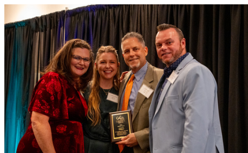
Believer Award WISPACT