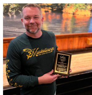
Community Impact Award Muskellounge and Sporting Club

Read more about these amazing award recipients here: