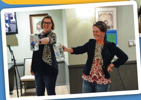
Attendees had fun competing in the stein hoist at the Brew Ha Ha!