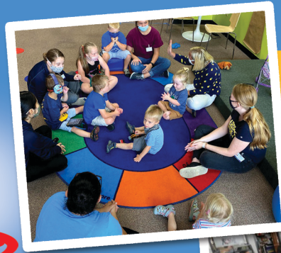
Participants enjoyed getting back into the playhouse this summer.