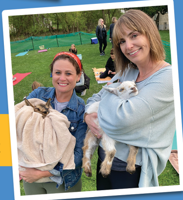
Everyone had a great time at baby goat yoga!