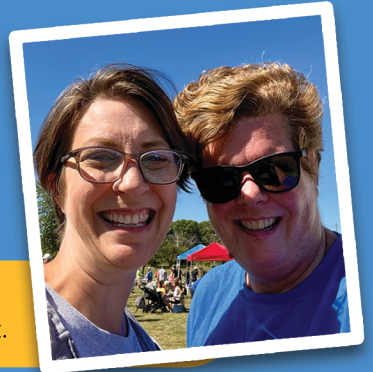
Board members enjoyed supporting Mel's Charities at the Bag for Bucks Tournament.