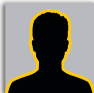
YOU??? Board Member

We need YOU! We are looking for board members to grow into the future. Join us!