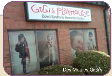
Des Moines GiGi's

This applies to all of you, too! We could not do this without all of you! Keep reading, then we will meet again on page 4!