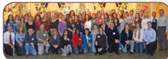
At our 2nd Annual Board Retreat, we had 70 people representing 10 Playhouses!

We often get asked how we choose locations to open a Playhouse. The answer is, we don't! People call the National Office asking how to get a Playhouse in their area. Together, with guidance from the Executive Board, we lead the various locations through the in depth process of opening a Playhouse... everything from gathering potential board members to the legal implications of becoming an LLC, training for Literacy and other programs to helping shape the look of their Playhouse! GiGi's Playhouse, Inc. knows that, with your help , we can continue opening Playhouses in states around the nation and countries around the world. By helping individuals with Down syndrome reach their potential in their communities, we can increase awareness on an international level and 1 community, 1 state, 1 country at a time, we can change the way the world views Down syndrome!