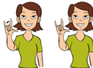
I LOVE YOU