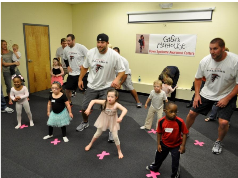
GiGi's Playhouse Attendees Having Fun with the Atlanta Falcons

With one in 691 babies born with T21 in the United States today, we know that by providing the tools for individuals to reach their full potential, we can change the perceptions that people may have of the illness, resulting in a world that is empowered with knowledge, compassion and inspiration.