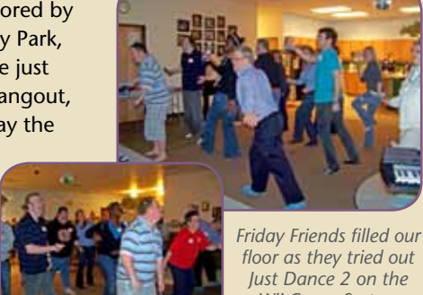
floor as they tried out Just Dance 2 on the Wii Game System

new playhouse. April brought an Easter Party sponsored by Starbucks, Machesney Park, IL. All in all people are just enjoying their new hangout, they sing karaoke, play the piano, foosball, Wii, computer games and board games. Thanks to Gerry's Pizza too, they are also talking over pop and pizza.