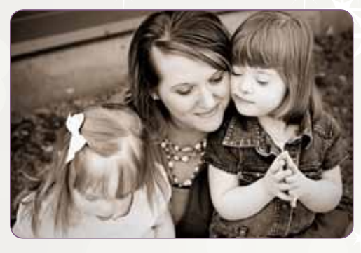
The Benefits of Circle Time