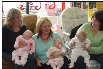
These 3 baby girls made fast friends at the Thursday playgroup! (Their mommy's did too!!)

That means you guys! A big thank you to everyone reading this newsletter. You may not know it, but you are helping people every day without even realizing it! New families and expectant parents visit the Playhouse all the time and feel HOPE by simply seeing pictures of all of your beautiful kids and the people that support them. At a time in their lives when they are being bombarded with negatives they can come to the Playhouse and see all the positives.