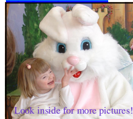
Look inside for more pictures!