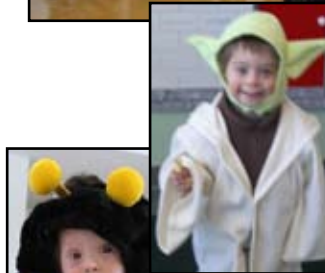
The kids had a great time parading through the new Infiniti dealership of Schaumburg showing off their costumes! Infiniti of Schaumburg are great new friends to the Playhouse!