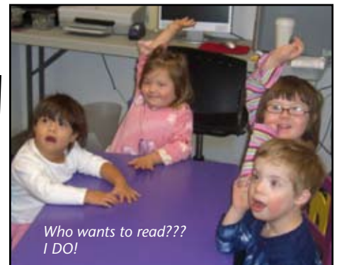
Who wants to read??? I DO!

To read Donna's story and Jessica's mom's story go to page 5.